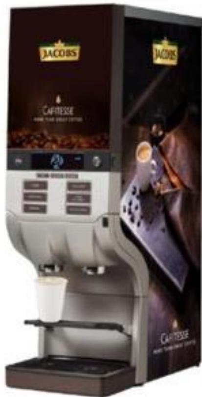
CAFITASSE NG 120