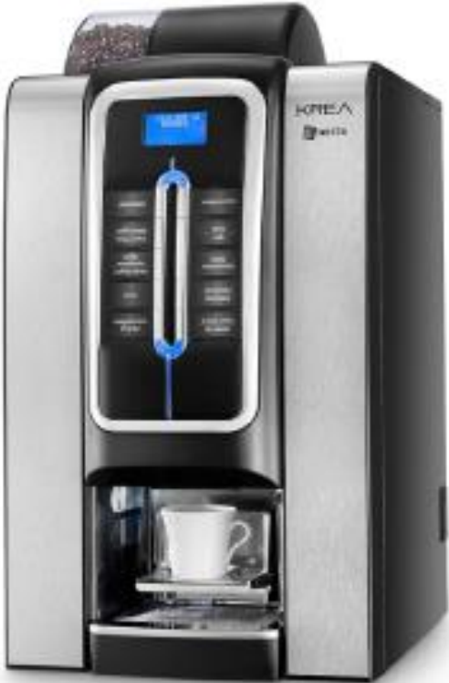
KREA BEAN TO CUP (Fully Automatic)